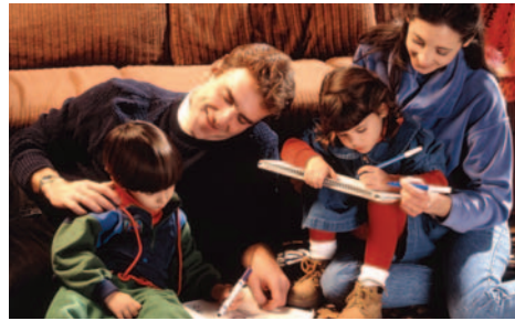
The best protection requires the involvement of the parents.